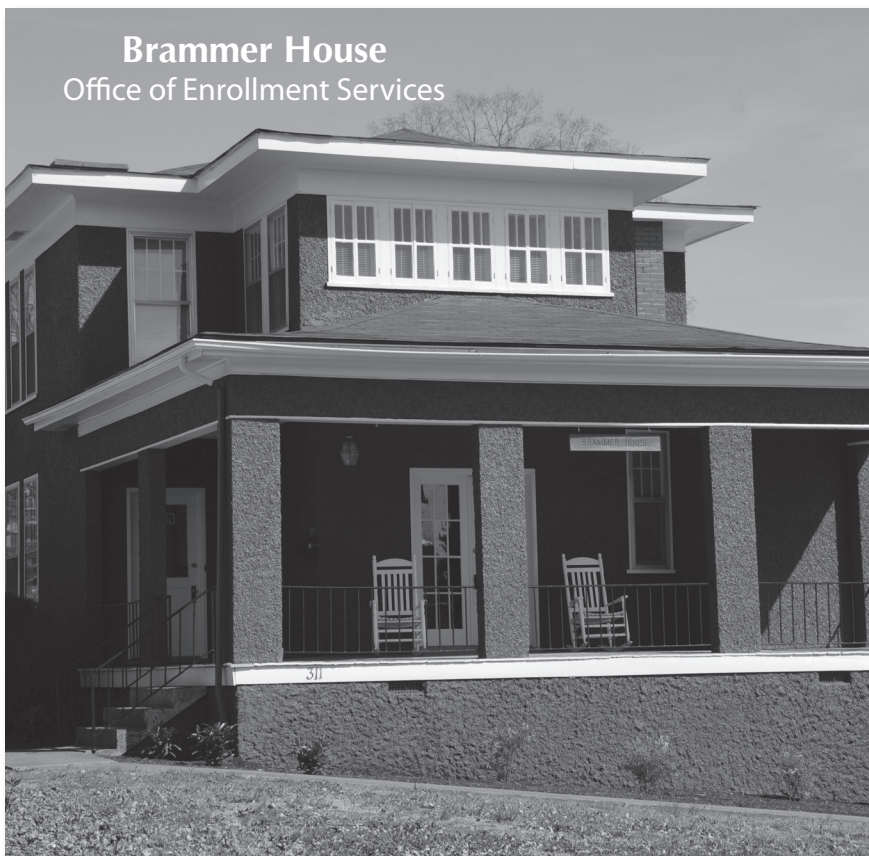
Brammer House Office of Enrollment Services